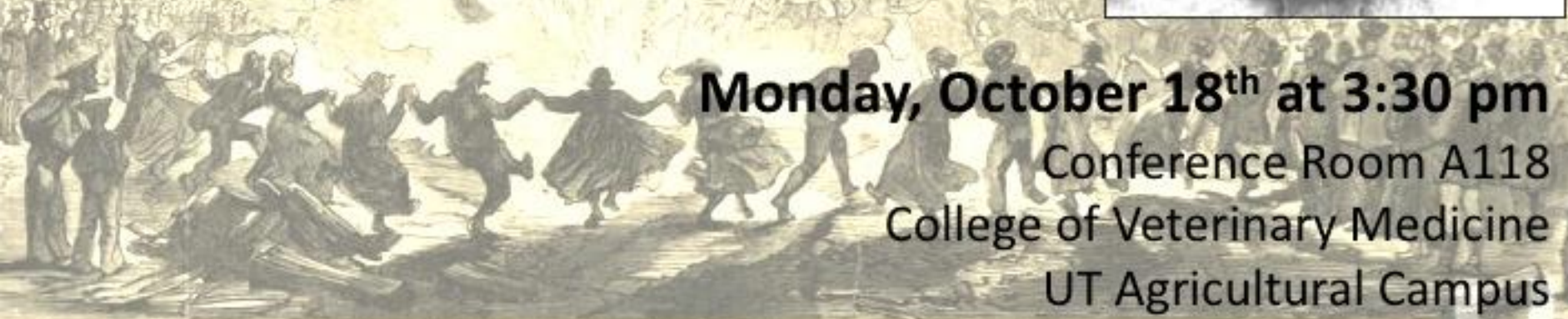
CHOLERA AT MARSEILLES—FIRES LIGHTED IN THE SQUARE OF THE OLD PALACE OF JUSTICE TO DESTROY THE PESTILENCE.

Conference Room A118 College of Veterinary Medicine UT Agricultural Campus